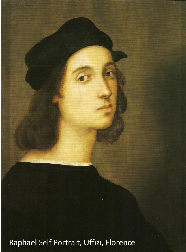
Raphael Self Portrait, Uffizi, Florence

This lecture charts the meteoric rise to prominence of the artist Raphael (1483-1520). In 1500, aged seventeen, Raphael entered the workshop of the successful Umbrian artist Pietro Perugino and so began his emergence as one of the greatest masters of the High Renaissance. While lacking his older rivals Leonardo da Vinci (1452-1519) and Michelangelo Buonarroti's (1475- 1564) advantage of being born and trained in Florence, he was generally admitted to be their equal. Raphael's early work is analysed alongside his commissions in Florence and for the Papacy in Rome which demonstrate the genius of his extraordinary talent.