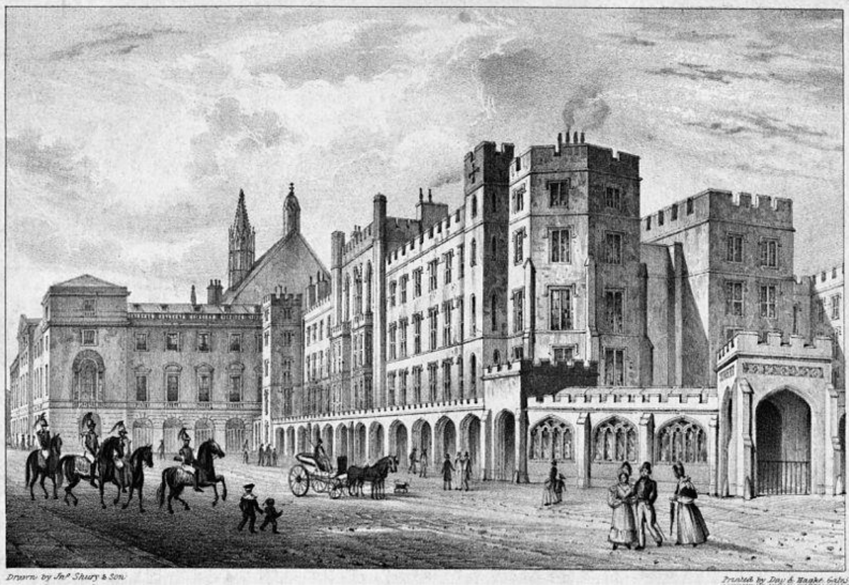
The Houses of Parliament before the fire of 1834.

A Royal Commission was appointed to study the rebuilding of the Palace and a heated public debate over the proposed styles followed. The neo-classical style , such as used for the White House in the United States, was popular at the time however, the commissioners associated this with revolution and republicanism while the Gothic style was felt to embody conservative values. In June 1835 they announced the buildings style of the buildings should either be Gothic or Elizabethan.