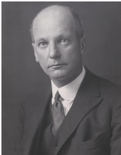
Sir Giles Gilbert Scott

Despite all this rebuilding some parts of the buildings from the earliest times have been retained. Some of these features can be seen in the videos linked from the end of this article.